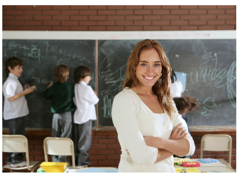
*2016 Delaware school climate Survey of 154 schools